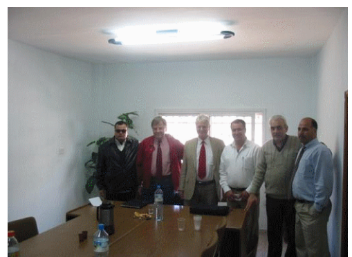
Meeting with Bethlehem Chamber of Commerce on April 8 th