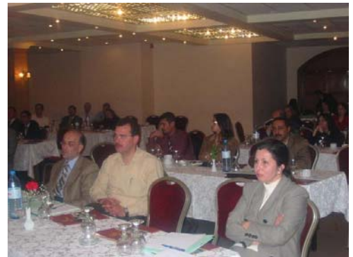
PSC Launch at Grand Park Hotel on April 11 th