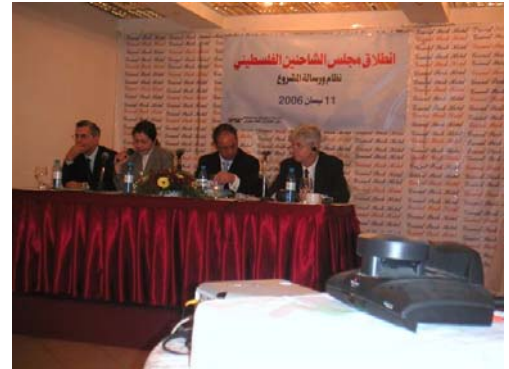
PSC Launch at Grand Park Hotel on April 11 th