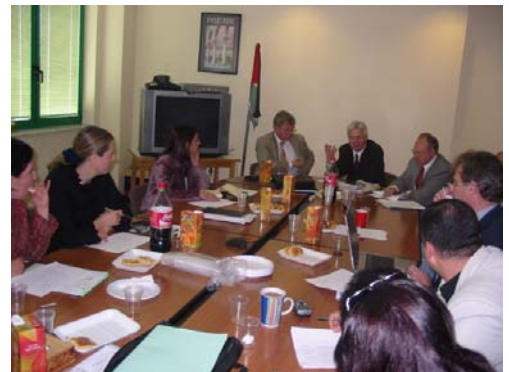
Prep Com meeting with UNCTAD experts on April 10 th